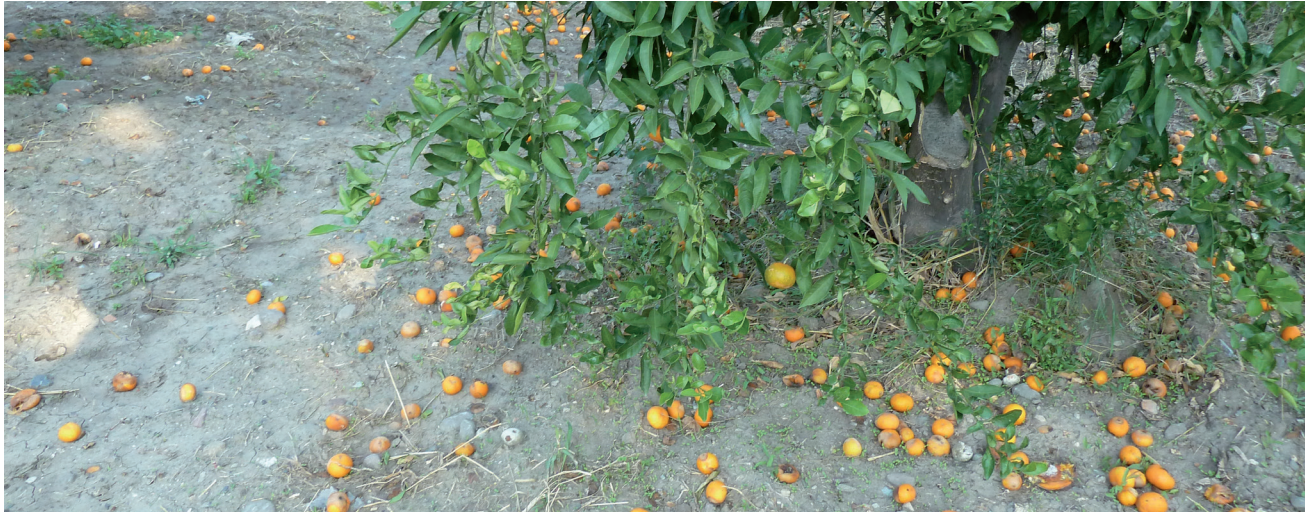
Untreated plot with much C. Capitata damaged fruit on the ground.