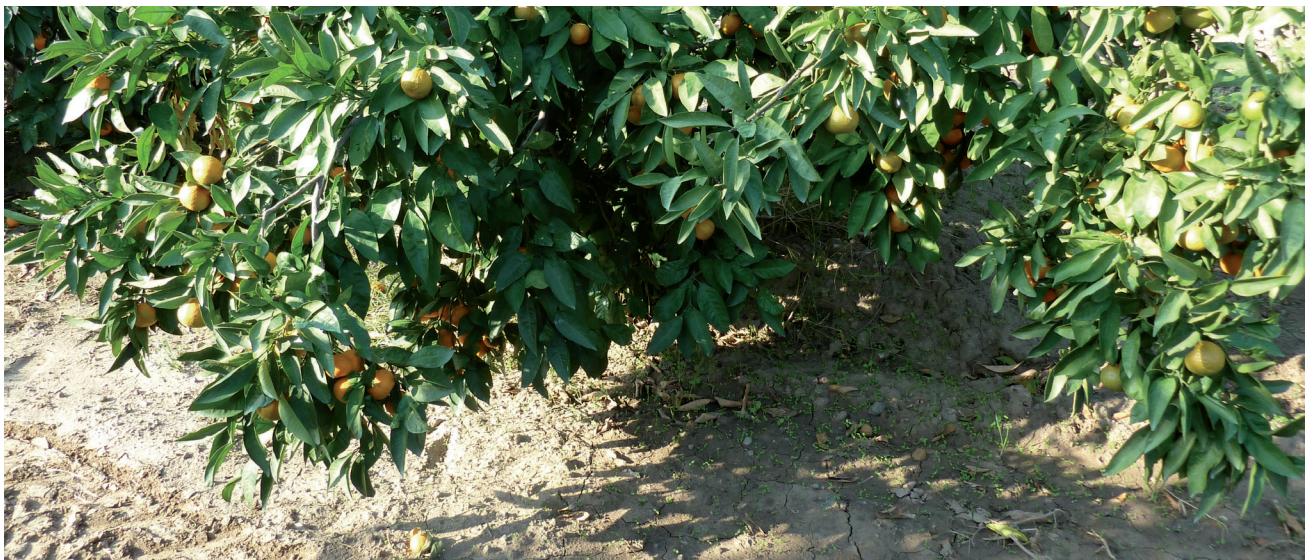
Exirel® Insecticide plot with almost no damaged fruit on the ground.