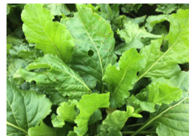
Lucento fungicide 5.5 oz. + Topsin fungicide 10 oz. (A) fb Koverall ® fungicide 2 lbs. + Topguard fungicide 14 oz. (B) fb Koverall fungicide 2 lbs. (C) fb Koverall fungicide 2 lbs. + Super Tin fungicide (D)