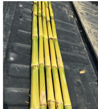
Xyway 3D fungicide 11.8 oz./A at-plant, in-furrow