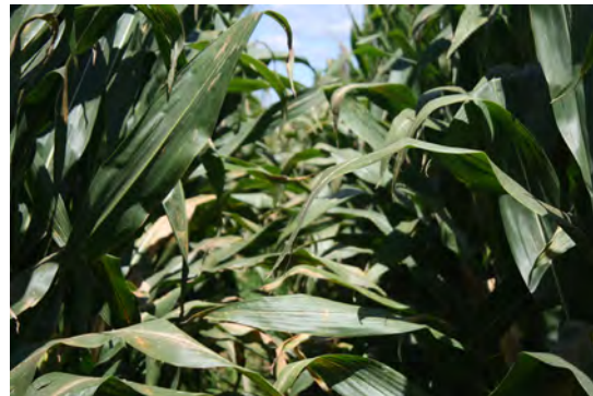
Xyway LFR fungicide 15.2 fl. oz./A at-plant, in-furrow

Always read and follow all label directions, precautions and restrictions for use. Xyway 3D and Xyway LFR fungicides may not be registered for sale or use in all states. Contact your local FMC representative or retailer for details and availability in your state. FMC, the FMC logo, 3RIVE 3D, LFR, Lucento, Topguard and Xyway are trademarks of FMC Corporation or an affiliate. Trivapro is a trademark of a Syngenta Group Company. Headline AMP is a trademark of BASF. ©2020 FMC Corporation. All rights reserved. 20-FMC-1575 10/20