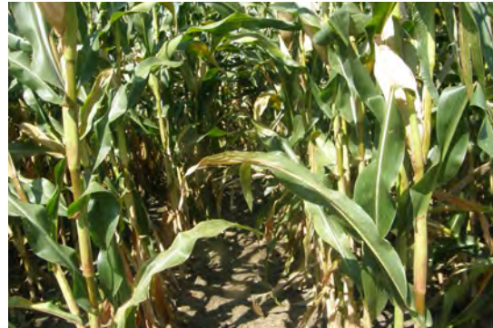
Xyway 3D fungicide 11.8 oz./A at-plant, in-furrow