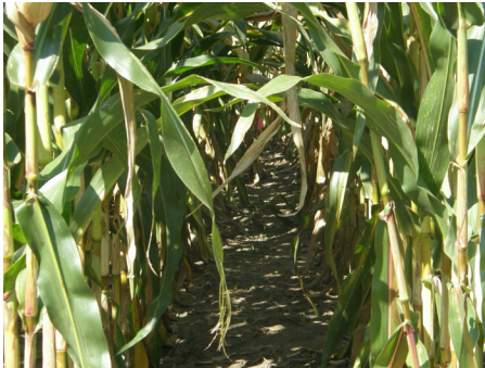
Xyway 3D fungicide fb Lucento® fungicide

Kansas State University, Topeka, KS 2019