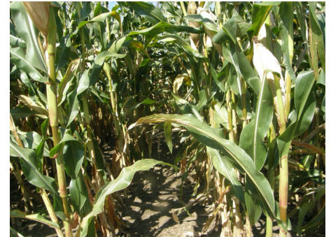
Xyway 3D fungicide 11.8 fl. oz./A at plant