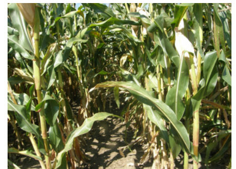
Xyway 3D fungicide 11.2 fl. oz./A at plant