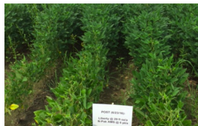
18 DAT: Liberty herbicide 29 fl. oz./A + AMS 2.5 lbs.