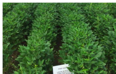
18 DAT: Liberty herbicide 29 fl. oz./A + Cadet herbicide 0.5 fl. oz./A + AMS 2.5 lbs.