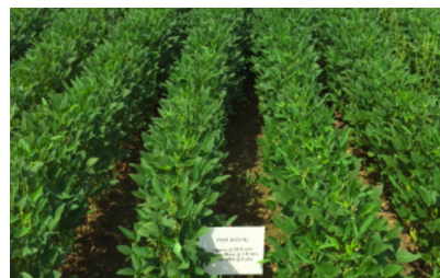
18 DAT: Liberty herbicide 29 fl. oz./A + Anthem MAXX herbicide 3 fl. oz./A + AMS 2.5 lbs.