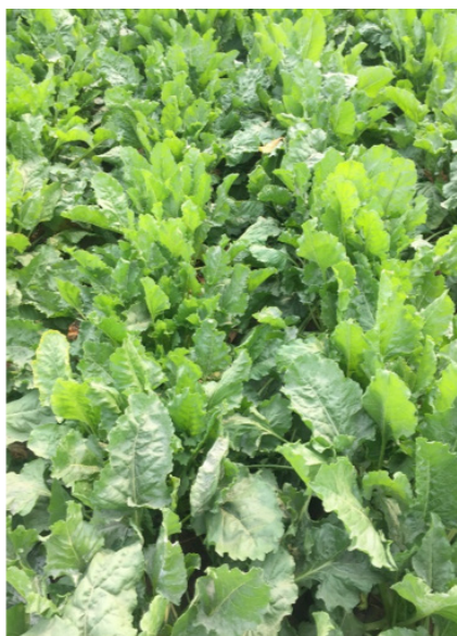
Lucento fungicide 5.5 fl. oz. fb Topguard EQ fungicide 7.0 fl. oz. 41 DAT