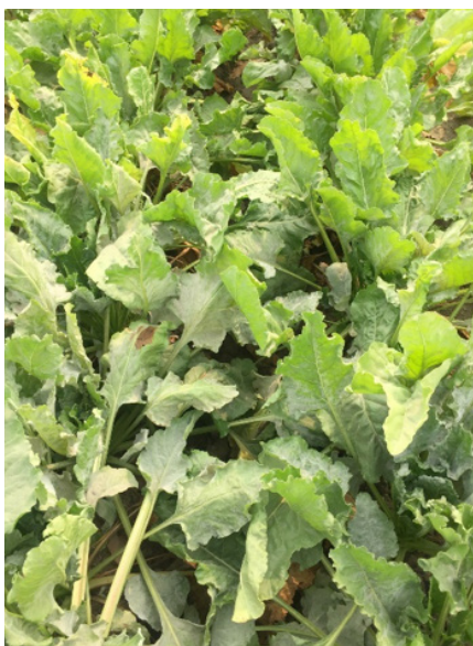
Inspire XT fungicide 7.0 fl. oz. fb Inspire XT fungicide 7.0 fl. oz. 41 DAT