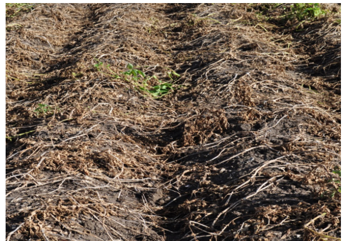
Aim® EC herbicide - 2 fl. oz./A + Reglone® desiccant 16 fl. oz./A

To learn more about Aim® EC herbicide, contact your FMC Star Retailer or visit FMCCrop.com .