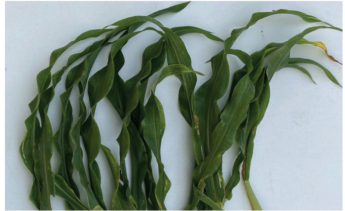
Xyway LFR fungicide 15.2 fl. oz./A, at-plant, 2x2*