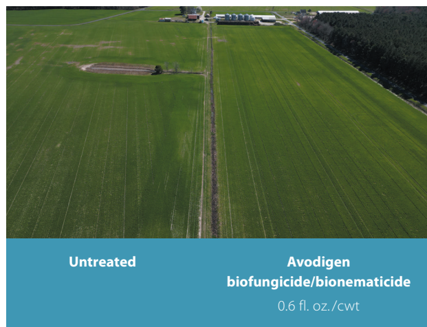
Imagery: Marion, MD – March 20, 2024

To learn more about Avodigen biofungicide/bionemacide, contact your FMC representative or visit AG.FMC.COM .