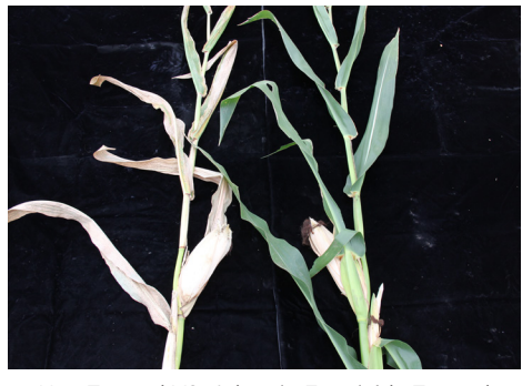
Non-Treated VS. Adastrio Fungicide Treated (47 days post-application)