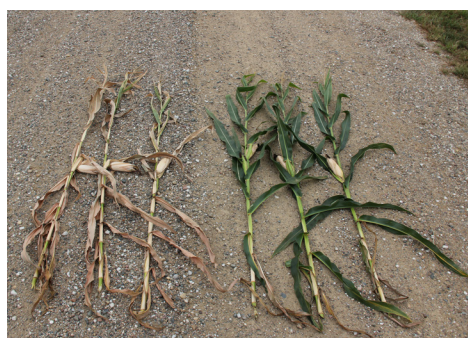
Non-Treated VS. Adastrio Fungicide Treated (47 days post-application)