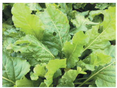
Lucento fungicide 5.5 oz. + Topsin fungicide 10 oz. (A) fb Koverall fungicide 2 lbs. + Topguard fungicide 14 oz. (B) fb Koverall fungicide 2 lbs. (C) fb Koverall fungicide 2 lbs. + Super Tin fungicide (D)