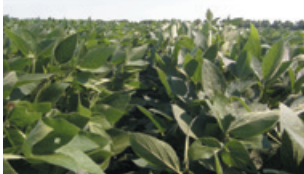
Ethos 3D insecticide/fungicide

The plants treated with Ethos 3D insecticide/fungicide reached canopy quicker, providing better weed control earlier in the season.