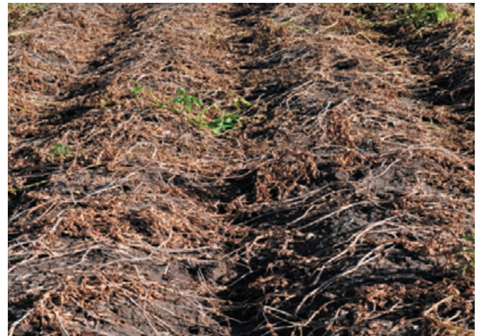
Aim EC herbicide — 2 fl. oz./A + Reglone desiccant 16 fl. oz./A

To learn more about Aim EC herbicide, contact your FMC retailer or visit AG.FMC.COM .