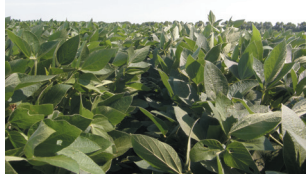
Ethos 3D insecticide/fungicide

The plants treated with Ethos 3D insecticide/fungicide reached canopy quicker, providing better weed control earlier in the season.