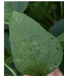
Stratego YLD fungicide 4 fl. oz./A