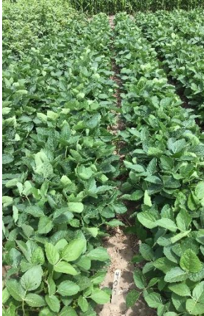
Cadet ® herbicide 0.5 fl. oz. + Anthem MAXX ® herbicide 2.5 fl. oz. + Roundup PowerMAX ® herbicide 32 fl. oz. @ EPOST