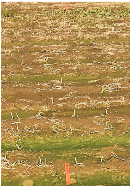
Trt. 4: Enlist Duo herbicide 56.5 fl. oz./A + Anthem® MAXX herbicide 3.25 fl. oz./A