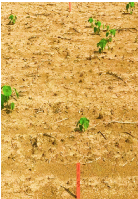
Trt. 15: Dual II Magnum ® herbicide 32 fl. oz./A