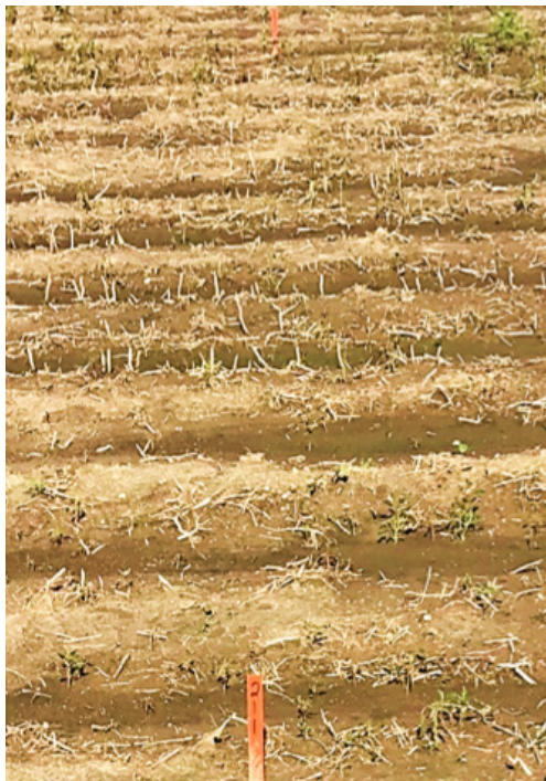
Trt. 6: Liberty® herbicide 32 fl. oz./A