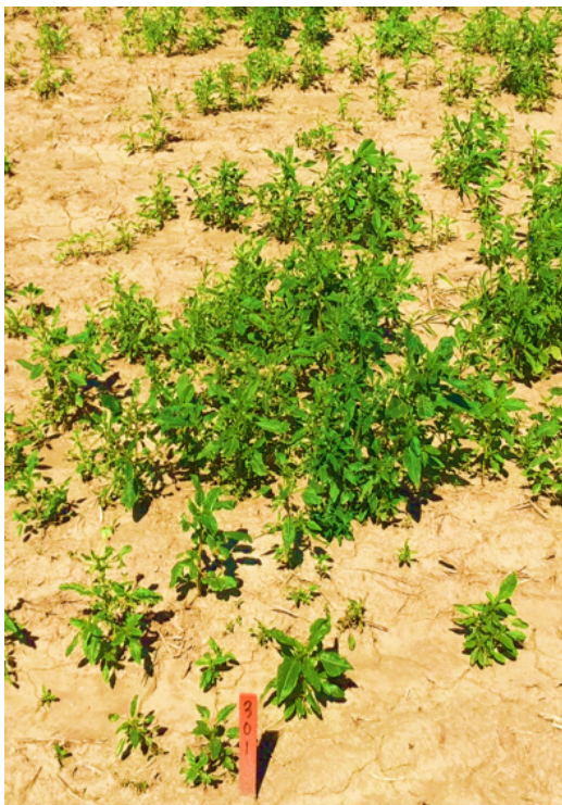
Trt. 1: NTC