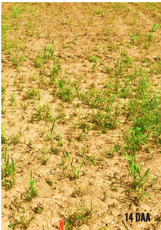
Trt. 3: Flexstar® herbicide 16 fl. oz./A