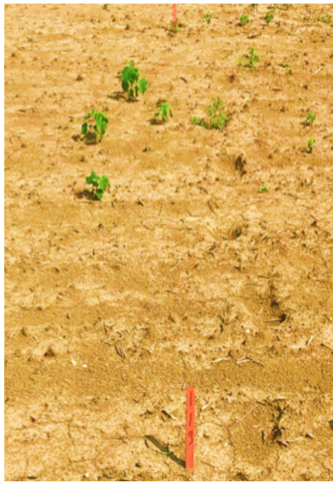
Trt. 13: Warrant ® herbicide 96 fl. oz./A