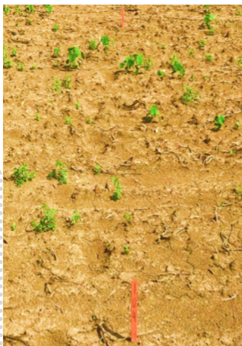
Trt. 4: Outlook ® herbicide 12.8 fl. oz./A