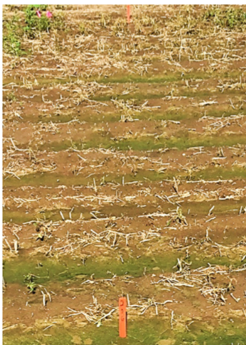
Trt. 8: Liberty herbicide 32 fl. oz./A + Anthem® MAXX herbicide 3.25 fl. oz./A