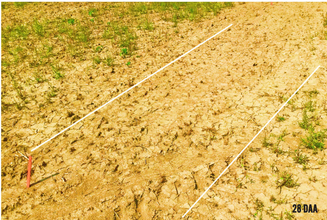
Trt. 7: Liberty herbicide 32 fl. oz./A