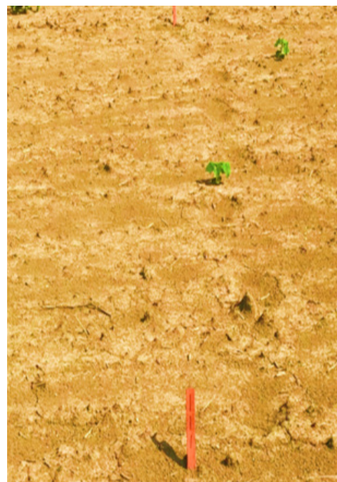
Trt. 16: Prefix ® herbicide 48 fl. oz./A