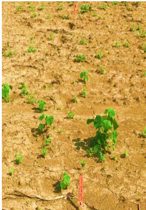
Trt. 3: Warrant ® herbicide 48 fl. oz./A