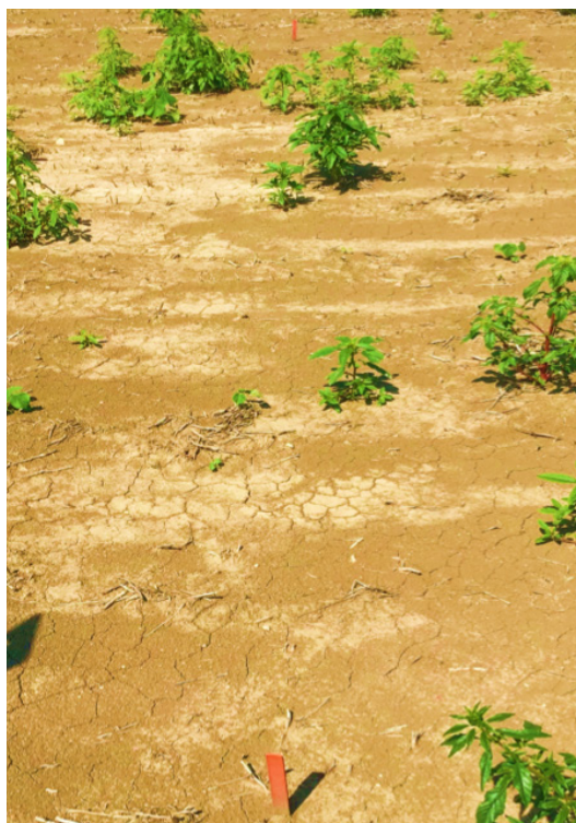
Trt. 2: Boundary ® herbicide 32 fl. oz./A