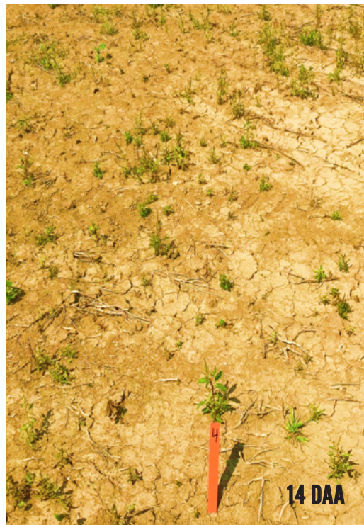
Trt. 2: Cobra® herbicide 12 fl. oz./A