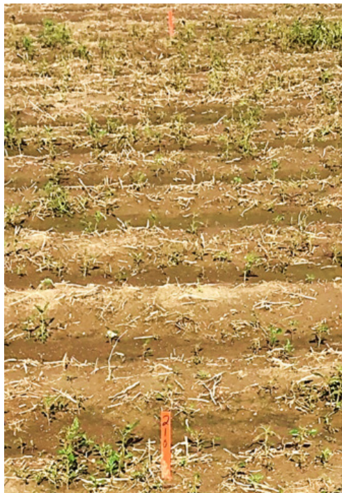
Trt. 7: Liberty herbicide 32 fl. oz./A