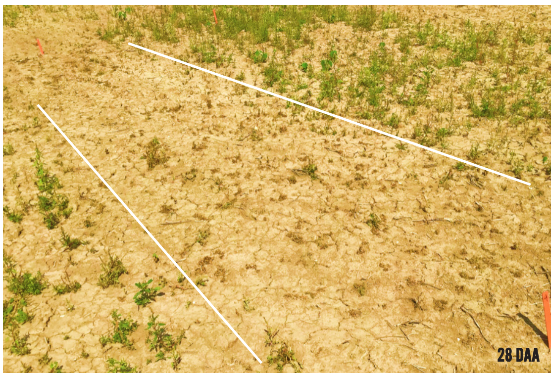
Trt. 5: Enlist Duo herbicide 56.5 fl. oz./A