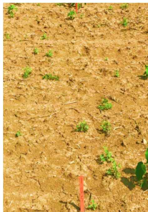
Trt. 6: Prefix ® herbicide 32 fl. oz./A