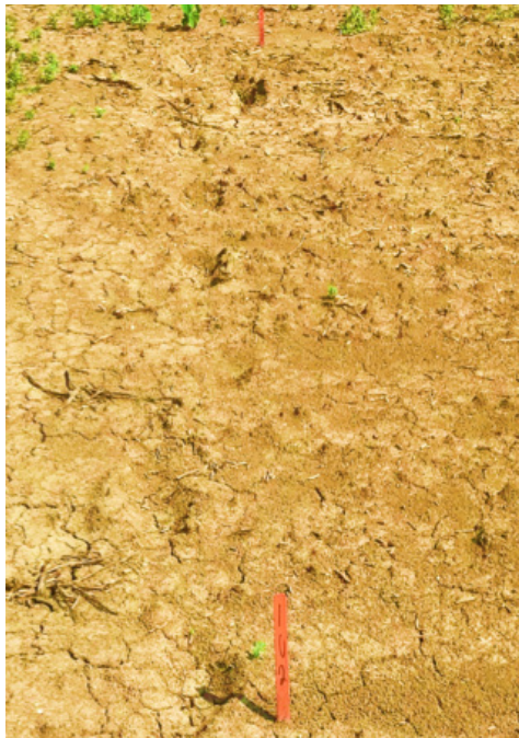
Trt. 2: Anthem ® MAXX herbicide 3 fl. oz./A