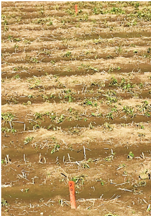
Trt. 2: Enlist Duo® herbicide 56.5 fl. oz./A