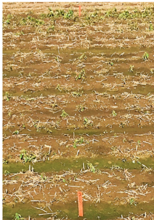
Trt. 5: Enlist Duo 56.5 fl. oz./A + Anthem MAXX herbicide 3.25 fl. oz./A