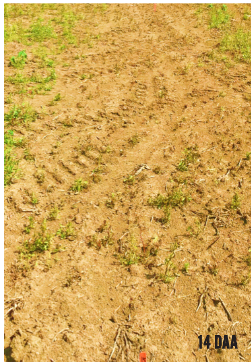
Trt. 4: Roundup PowerMax® herbicide 32 fl. oz./A + Flexstar® herbicide (16)+ Anthem® MAXX herbicide (3.25)