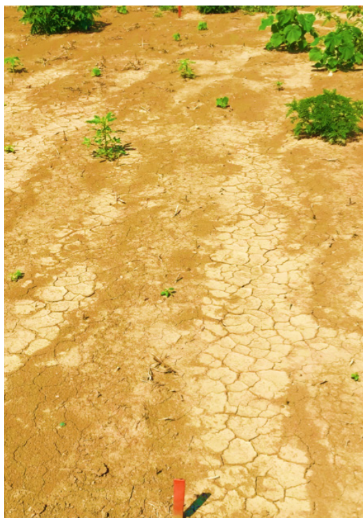
Trt. 4: Authority ® Supreme herbicide 7 fl. oz./A