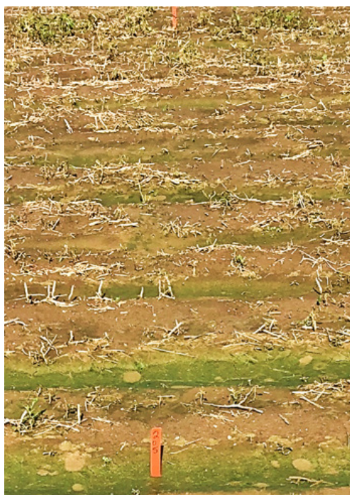
Trt. 9: Liberty herbicide 32 fl. oz./A + Anthem MAXX herbicide 3.25 fl. oz./A