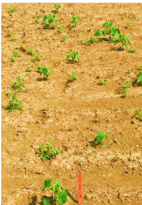
Trt. 5: Dual II Magnum ® herbicide 16 fl. oz./A