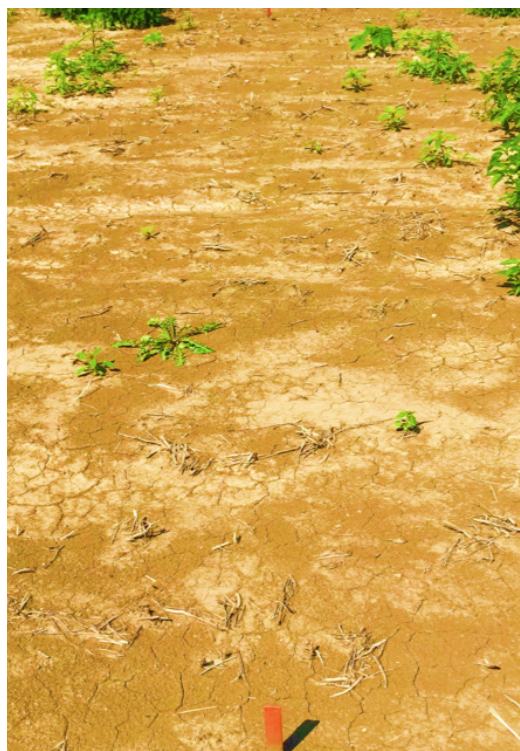
Trt. 5: Authority Supreme herbicide 7 fl. oz./A + Metribuzin 5 oz./A