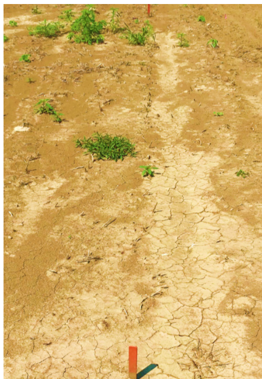
Trt. 3: Zidua ® Pro herbicide 6 fl. oz./A