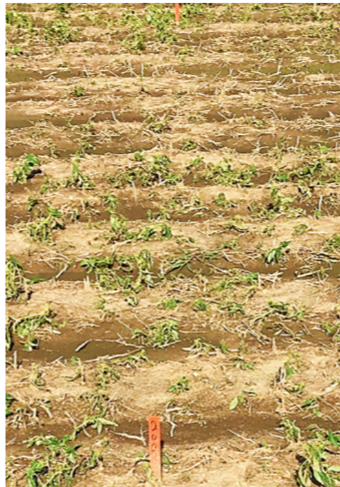
Trt. 3: Enlist Duo herbicide 56.5 fl. oz./A