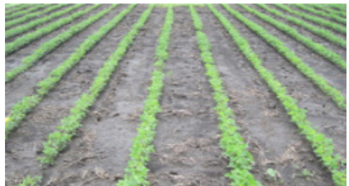
Authority Assist herbicide 9 fl. oz./A SDSU. Pictures 30 days after planting.