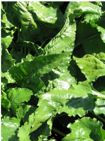
Lucento fungicide 5.5 fl. oz./A fb Lucento fungicide 5.5 fl. oz./A