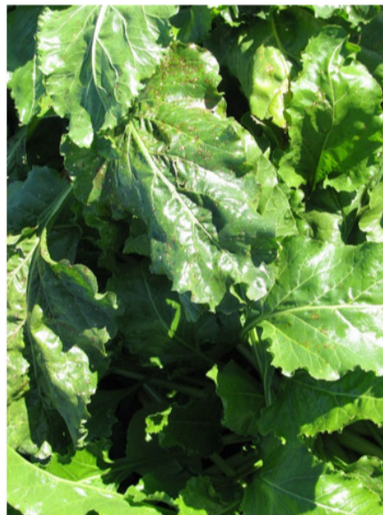
Priaxor Xemium fungicide 6.0 fl. oz. Priaxor Xemium fungicide 5.7 fl. oz./A