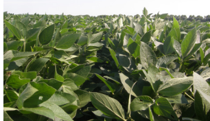
Ethos 3D insecticide/fungicide

The plants treated with Ethos 3D insecticide/fungicide reached canopy quicker, providing better weed control earlier in the season.