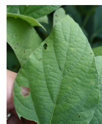
Lucento fungicide 5 fl. oz./A

Always read and follow all label directions, restrictions and precautions for use. Some products may not be registered for sale or use in all states. Lucento® fungicide may not be registered for sale or use in all states. Contact your local FMC retailer or representative for details and availability in your state. FMC, the FMC logo, Lucento and Topguard are trademarks of FMC Corporation or an affiliate. Priaxor is a trademark of BASF SE. Stratego is a trademark of Bayer. Quadris Top is a trademark of a Syngenta Group Company. Domark is a trademark of Isagro SpA Corp. ©2019 FMC Corporation. All rights reserved. 18-FMC-0954 01/19