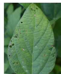
Priaxor D fungicide 5 fl. oz./A