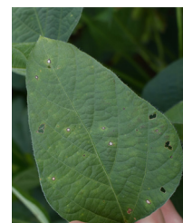
Stratego YLD fungicide 4 fl. oz./A