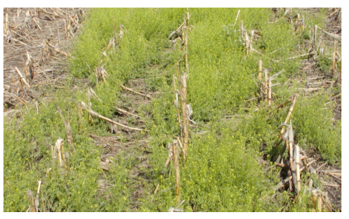
Burndown Tank Mixture for Glyphosate Resistant Marestail Southern Illinois University - 2015