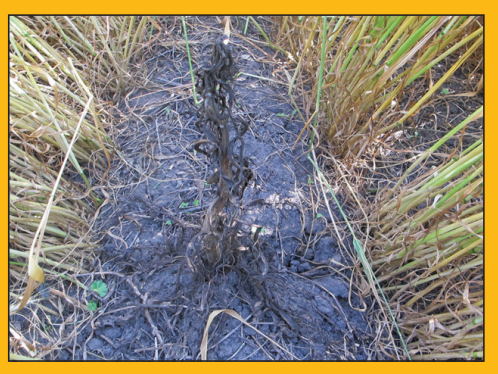
47 days after application