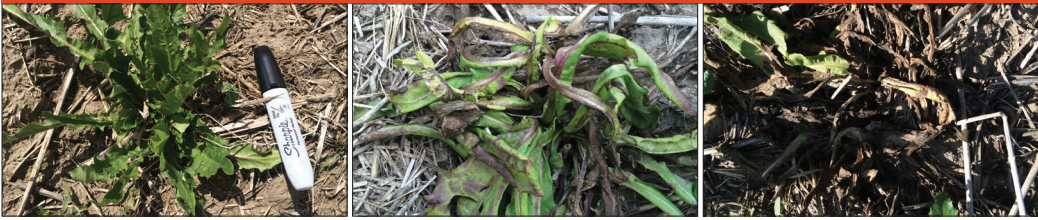
Day of Application –15" Dandelion Legal, AB