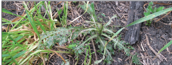
45 Days After Application Rivers, MB