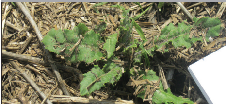
Canada thistle Rivers, MB