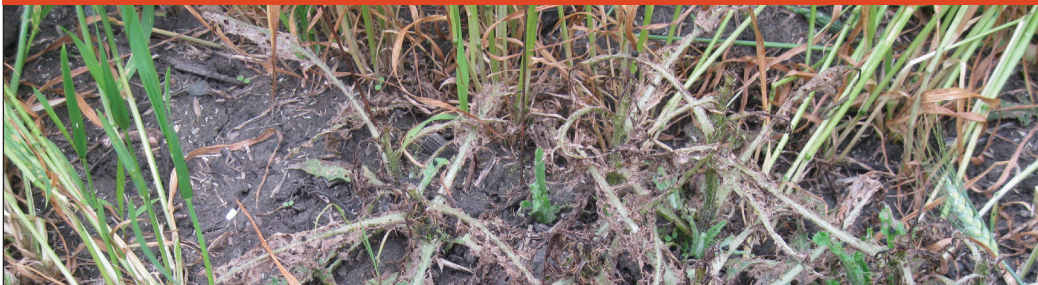
45 Days After Application Rivers, MB