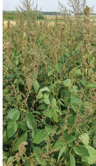
½ L REL glyphosate; 98 DAT; Portage, Manitoba