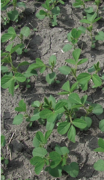
33 ac/jug Authority ® Supreme herbicide + ½ L REL glyphosate; 26 DAT; Portage, Manitoba