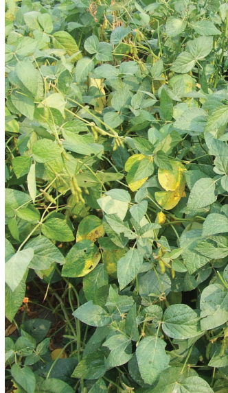
33 ac/jug Authority ® Supreme herbicide + ½ L REL glyphosate; 98 DAT; Portage, Manitoba