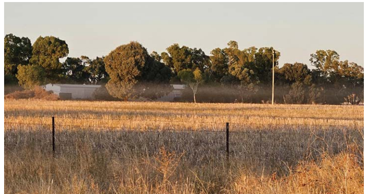
Dust caught in an inversion layer

A temperature inversion is when a layer of warm air is trapped between two cooler layers. This 'warm' layer prevents upward movement from the cool surface layer, creating very stable conditions. If a spray application were to occur during a temperature inversion, small droplets (fines) released from the boom spray can be 'trapped' in the warm layer of air and from there, travel anything from tens of metres to several kilometres before falling to the ground.