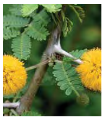
Mimosa bush (Vachellia farnesiana)

For parkinsonia, Graslan pellets need to be scattered evenly within 30 cm beyond the drip zone of the plant as the many surface roots are able to absorb the herbicide more evenly instead of placing all the pellets at the base of the plant. This also helps in residual control of seedlings that germinate in subsequent seasons.