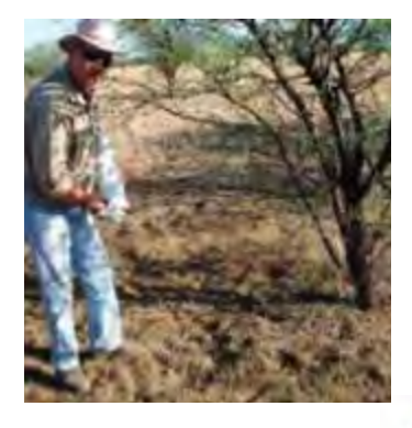
Application of Graslan to a prickly acacia plant: apply one dispenser unit dose (7 g) for every 1 m height of plant to the base of the plant as described and shown above.