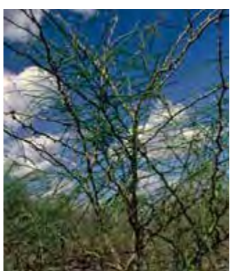
Parkinsonia (Parkinsonia aculeata)