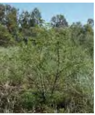
Mesquite ( Prosopis pallida ) WA Permit 82303