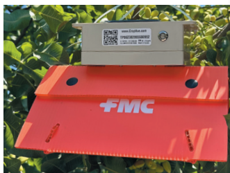
Automated Trap Sensor

Advanced machine learning technology provides pest pressure forecasts based on aggregated historical data, hyper-local weather data and real-time regional pest mapping.