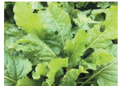
Lucento fungicide 5.5 oz. + Topsin fungicide 10 oz. (A) fb Koverall fungicide 2 lbs. + Topguard fungicide 14 oz. (B) fb Koverall fungicide 2 lbs. (C) fb Koverall fungicide 2 lbs. + Super Tin fungicide (D)