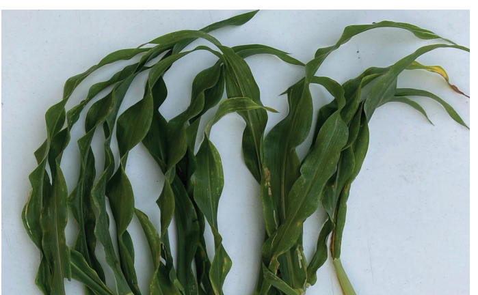
Xyway LFR fungicide 15.2 fl. oz./A, at-plant, 2x2*

Capture LFR insecticide is a Restricted Use Pesticide. Always read and follow all label directions, precautions and restrictions for use. Some products may not be registered for sale or use in all states. Xyway LFR fungicide and Xyway 3D fungicide may not be registered for sale or use in all states. Contact your local FMC retailer or representative for details and availability in your state. FMC, the FMC logo, Capture, LFR and Xyway are trademarks of FMC Corporation or an affiliate. ©2022 FMC Corporation. All rights reserved. 21-FMC-1956 08/22