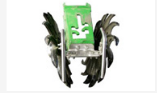
Furrow Forced Dual