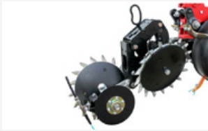
G2 Fertilizer Disc